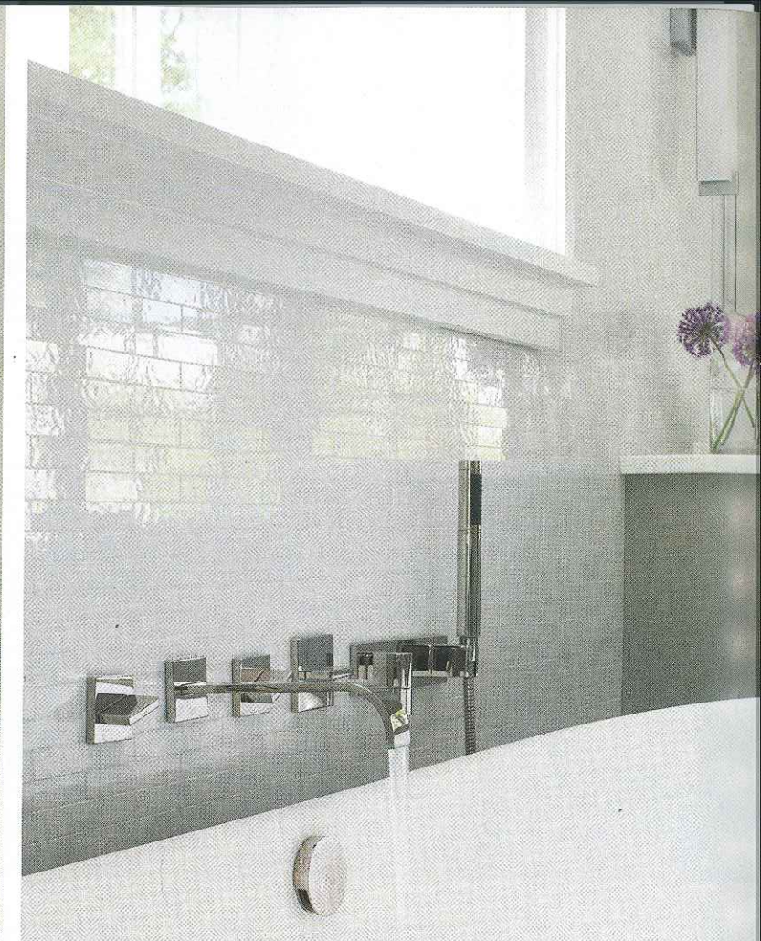
Curvilinear bedside lamps are a striking counterpoint to the fully upholstered, rectangle-paneled, floor-to-ceiling headboard. opposite: Behind the tub, a wall of white Glassos tile provides shimmer in the master bathroom. "It feels like water," says Lindsay. "It's ethereal without feeling too strong or overpowering the room." Modern hardware and wall sconces are paired with custom-designed his-and-hers vanities.

board and make that entire wall a strong focal point. We did a very clean, modern fireplace design without a mantle so it didn't feel heavy. The stone we chose is beautiful—the stone makes it.