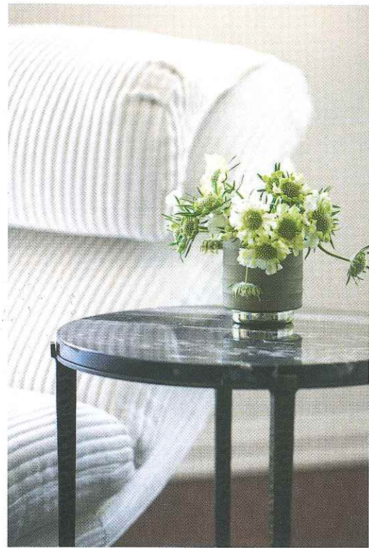
For a serene feel, the master bedroom is awash in champagne and silvery tones, and a wool-silk rug introduces various shades of gray to the palette. A vintage chaise is a welcoming sight when entering the room.