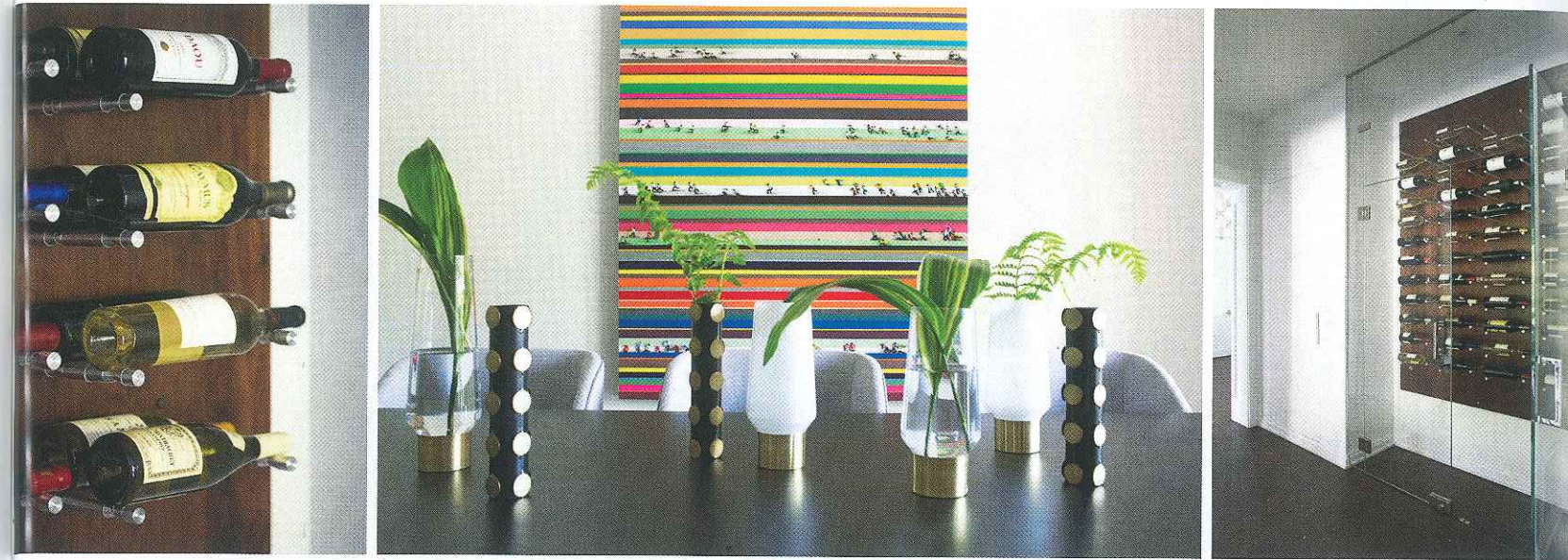
above: Artwork by Juan Genoves is a vivid touch in the dining room, and a custom walnut slab enclosed in glass provides temperature-controlled wine storage. below: The butler's pantry connecting the dining room and kitchen is painted Raccoon Fur by Benjamin Moore. opposite: A custom-designed dining table by Pimlico sits underneath a Ralph Pucci light fixture, and a subtle taupe metallic wallpaper covers the ceiling.