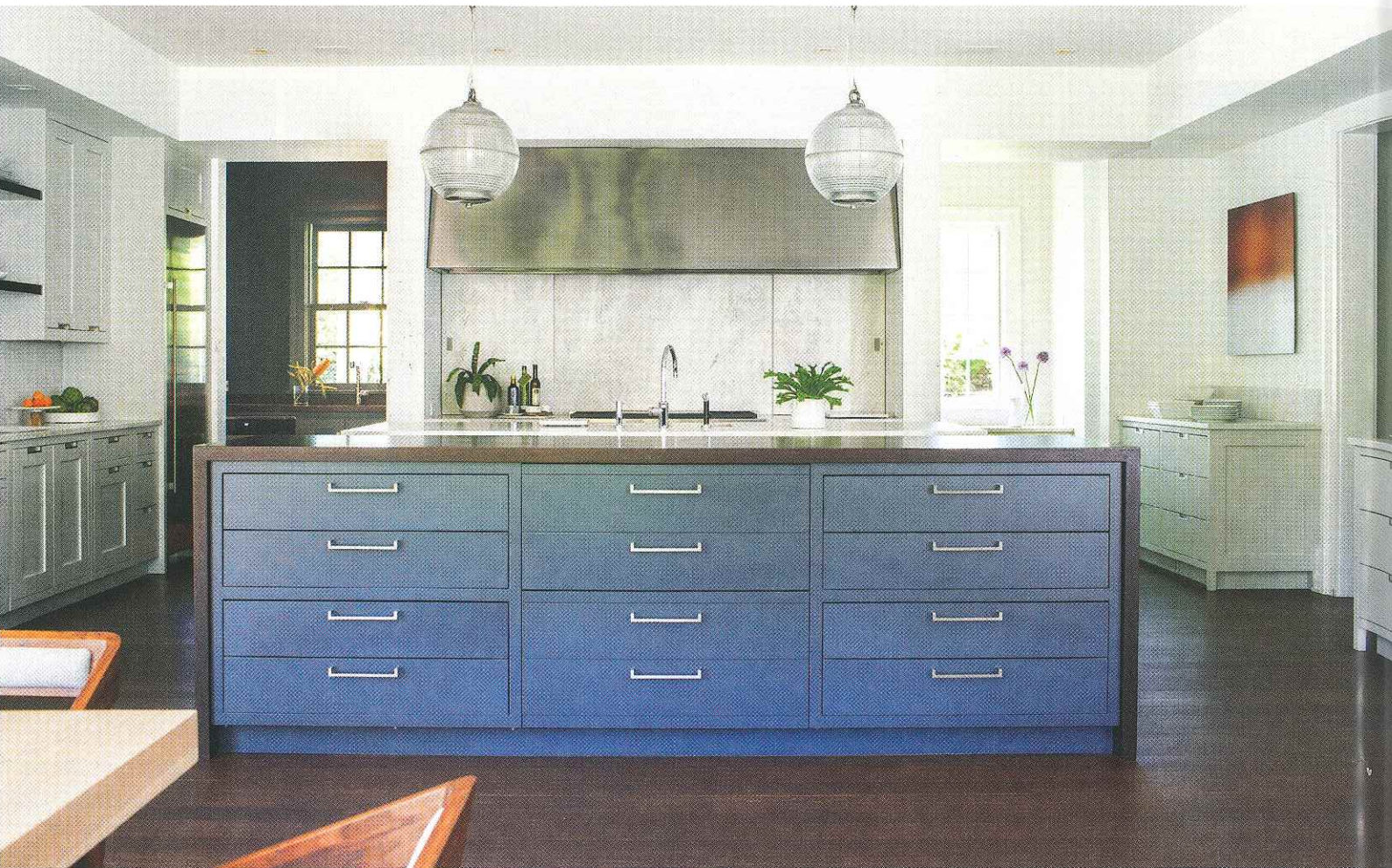
Designed with Gianna Santoro from Deane, Inc., the kitchen features vintage light fixtures from Avant Garden. Sliding slab doors under the hood conceal spices and oils for cooking, and the blue island houses several refrigerated drawers for easy access to drinks. opposite: A custom-designed solid white oak breakfast table by Pimlico is a favored spot for viewing the gardens outside.